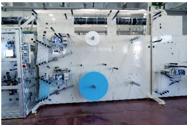
D-TECH respiratory mask line: Unwinding module