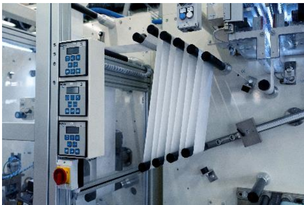
D-TECH respiratory mask line: Tension control system